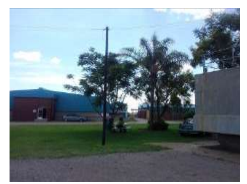
Overall neat and well maintained appearance