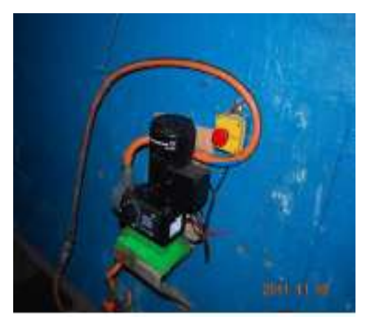
Loose wires and temporary pipes in dosing room