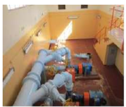
Neat pump station