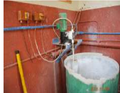
Chlorine dosing room required cleaning