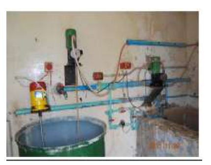
Untidy dosing room with redundant pumps and pipes