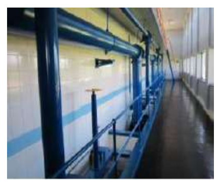
Clean filter gallery