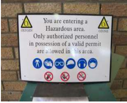
Example of good signage on site