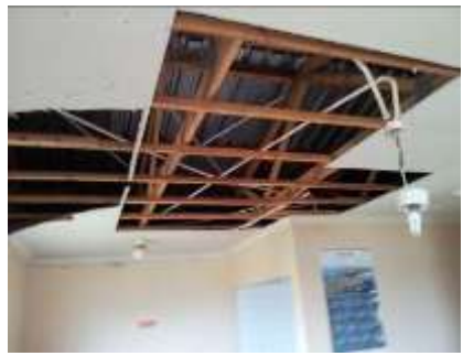
Broken roof in Process controllers change room