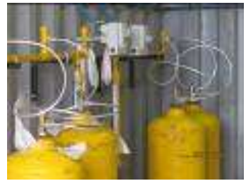
Spare chlorine cylinders in place with level indicator