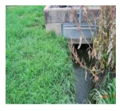
Overgrown sludge dam: sludge currently sent to river