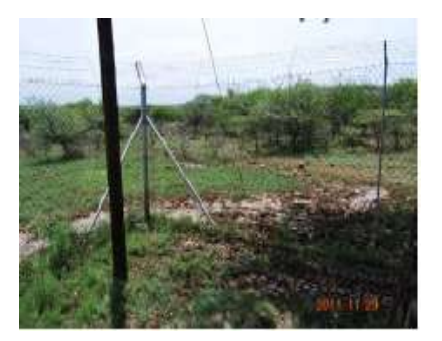
Sludge flowing out of plant