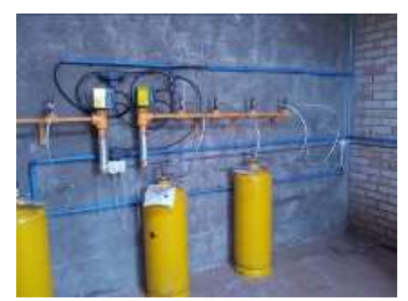
Chlorine room has no scale