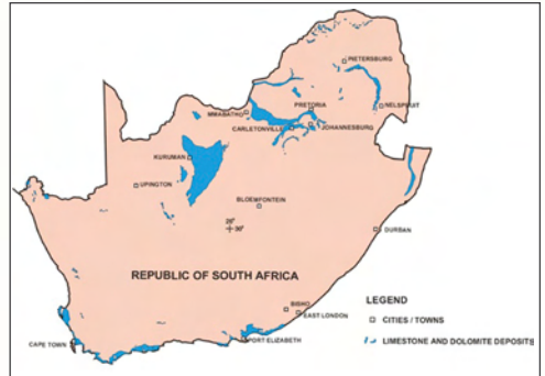
Distribution of dolomitic land in South Africa

In South Africa the word 'Dolomite', where it denotes the rock type, has substituted the word 'Dolomitic Limestone'. Dolomitic Limestone, as a natural rock, consists of the mineral dolomite ( \text{CaMg}(\text{CO}_3)_2 ) mixed with calcite (calcium carbonate, \text{CaCO}_3 ) and magnesite (magnesium carbonate, \text{MgCO}_3 ). Portions of the rock may be richer or poorer in either of the latter minerals. Dolomite is a sedimentary rock type. The dolomite rock in the Gauteng area formed around 300 million years ago.