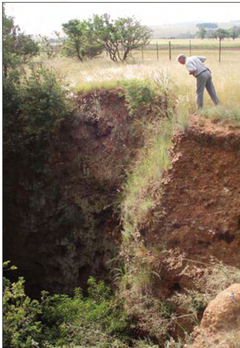
Large sinkhole in the dolomite rocks near Krugersdorp.

This booklet aims to give a short and clear summary of the available guideline documents dealing with development on karst dolomite land in South Africa. “Karst” refers to the typical landforms and processes in areas that are underlain by dolomite (calcium/magnesium carbonate) rock. These rocks can dissolve in the presence of water combined with carbon dioxide. This is a slow process that happens naturally as part of the weathering process. If the solution process has been carrying on for many millions of years, landforms, erosion features and subsurface solution cavities and cave systems form a special environment that is referred to as karst. In some places large openings can