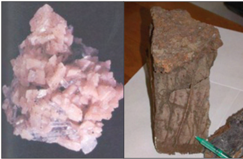
Dolomite the mineral (left) and the rock (right)

Dolomite is a single mineral consisting of the chemical combination of calcium and magnesium carbonate ( \text{CaMg}(\text{CO}_3)_2 ).