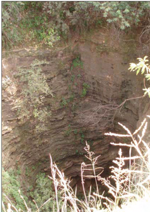
Sinkhole in dolomite

The stability of dolomitic land can depend partly on the groundwater conditions beneath the land surface. DWA is the government department concerned with managing South Africa’s water resources, and provides information to developers and others on groundwater conditions.