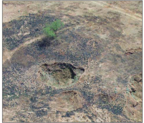
Aerial photograph of a sinkhole. (Garfield Krige, 2004)

The GSFH-2 Specification describes in detail the three different phases of geotechnical investigation that are needed for township developments. These can be summarised as follows: