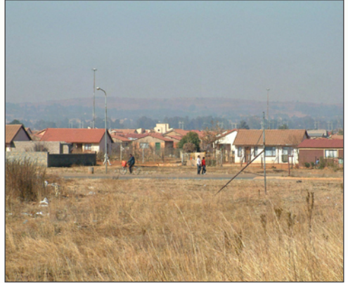
Housing development on dolomite near Randfontein

All future construction on dolomites will need to follow the requirements of the SANS 1936 document.