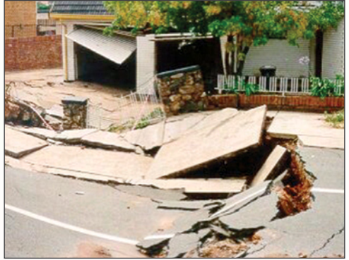
Doline in Laudium, Pretoria

Dolomite rocks make up some of South Africa's best aquifers. This is because they often support boreholes and springs which yield a lot of good-quality groundwater. There are frequently large fissures and openings in the rock, through which lots of groundwater can move quickly. These openings are caused by groundwater naturally dissolving away the dolomite rock, which usually happens very slowly. This is also the reason that caves (for example the Sudwala Caves) are often found in dolomites.