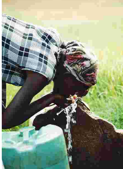
Water for household use will not be charged for water resource management.