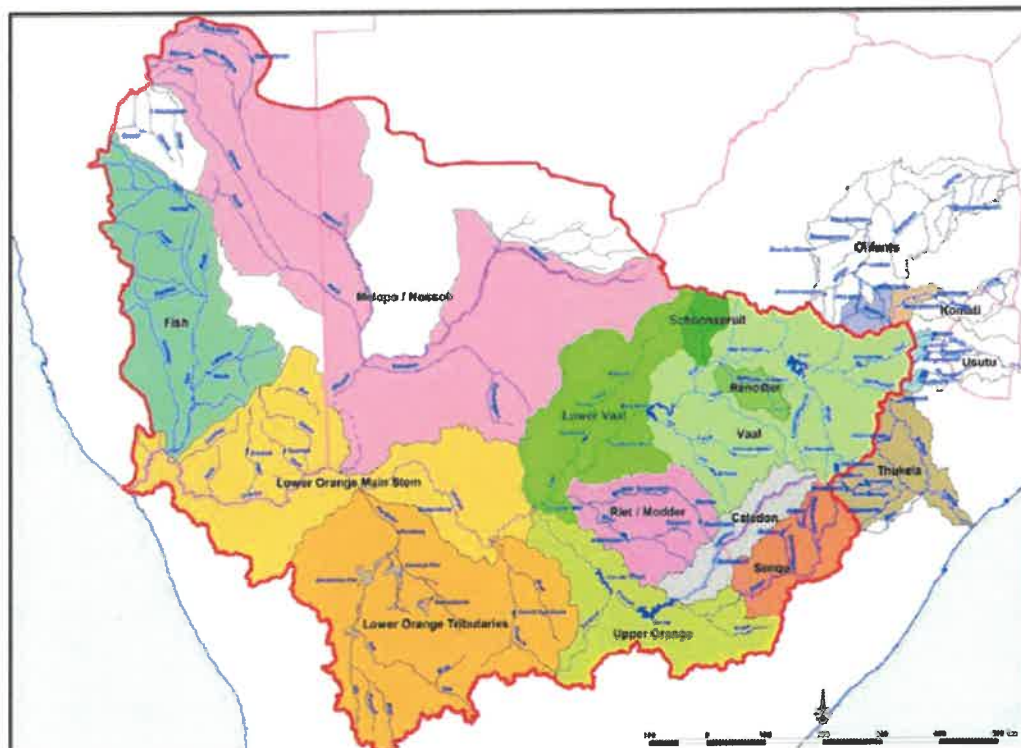
Figure 1: Planning Area Central with Orange River base map with hydrological zones

Planning Area Central forms the central to western part of South Africa as shown in Figure 1