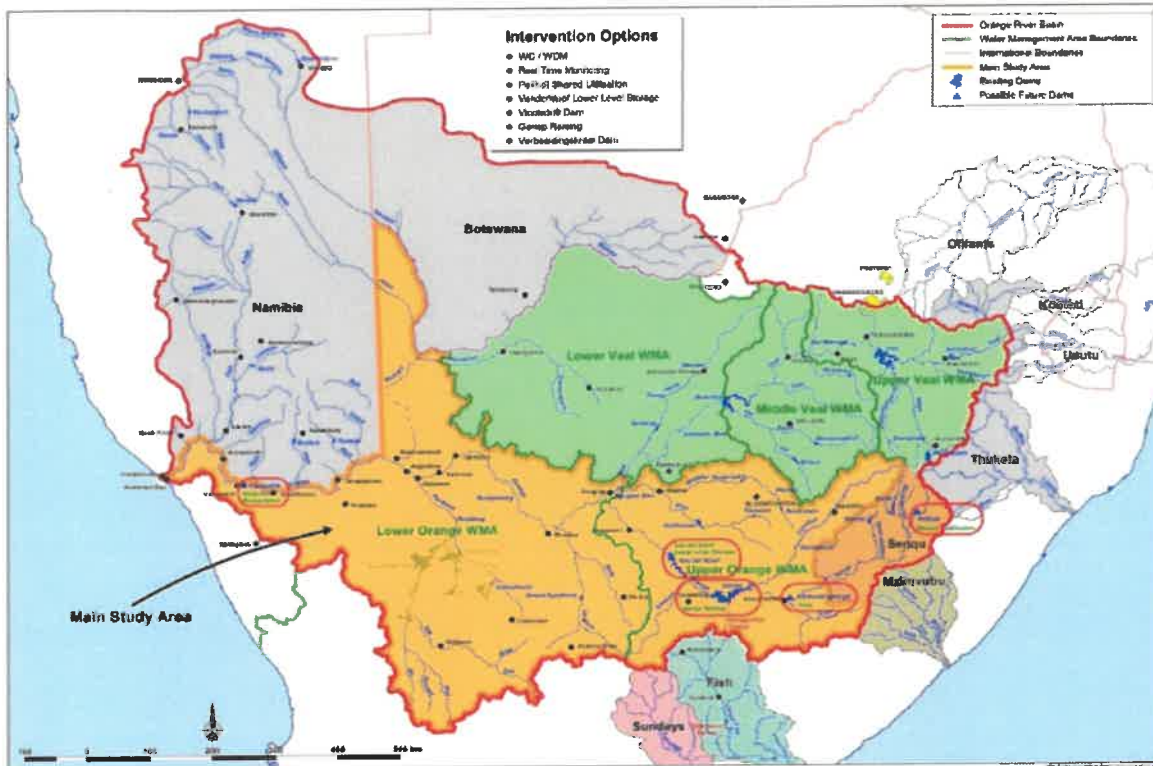
Figure 3: Orange River System main study area

The Orange River is an international resource, shared by four countries. Any developments, strategies or decisions taken by any one of the countries that will impact on the water availability or quality in South Africa must be taken into account and form part of this study. The opposite is also applicable. If the strategy plans anything in South Africa that will impact on any of the other countries, this impact must be considered as part of this study in terms of South Africa's international obligations.