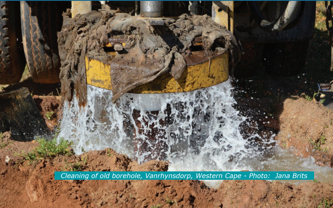
Cleaning of old borehole, Vanrhynsdorp, Western Cape

The National Water Act (NWA) (Act No 36 of 1998), Chapter 14 Part 2 requires the establishment of national monitoring and information systems because the availability of information about water resources is regarded as critical to the main purpose of the NWA. Section 139.2 (a) refers specifically to a national groundwater information system, which translates to the National Groundwater Information Systems (NGIS) Portfolio.