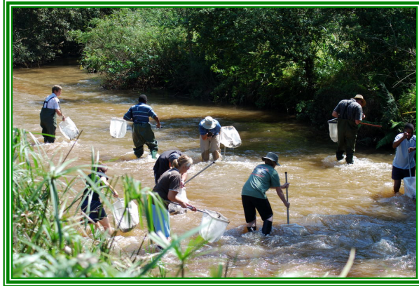
Aquatic invertebrates in the Sabie River under detailed scrutiny by delegates of the annual SASS5 training course.

The course provided practical training in the application of SASS5, including the criteria for selecting SASS5 sampling sites, the sampling protocol, safety precautions, identification and interpretation of SASS5 results. The course would be worth it just for those! The course was attended by 18 enthusiastic delegates from around the country, who were introduced to the diverse and fascinating invertebrates found in the Sabie and Treur Rivers. Delegates were assigned various practical tasks, including an assessment of the ecological impacts of a nearby sawmill on the Sabie River. The course ended with a self-test.