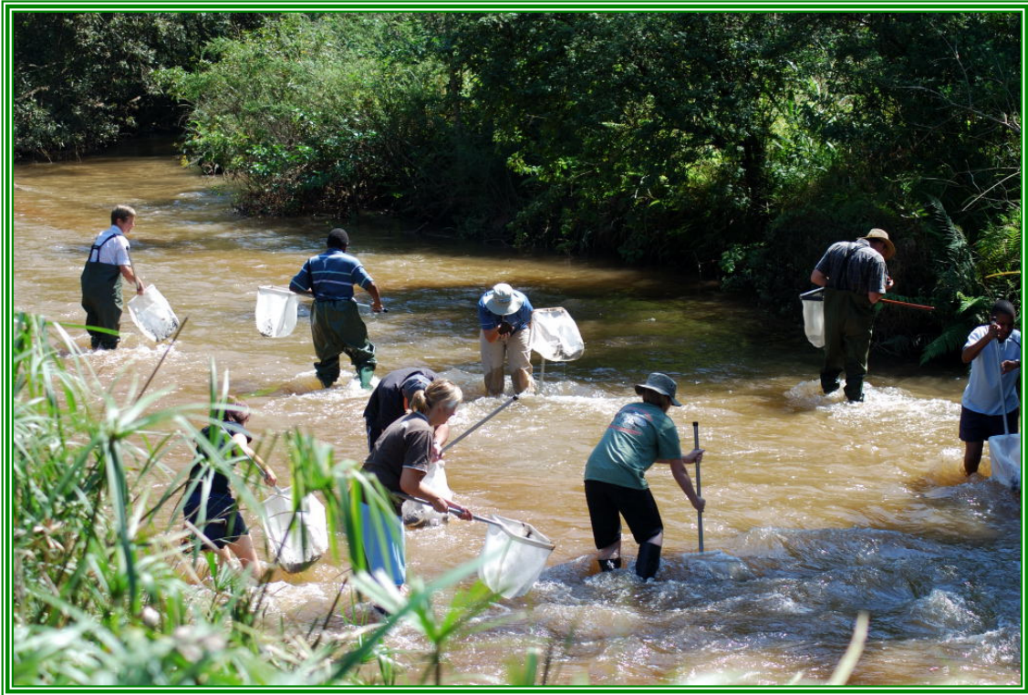
SASS5 Training offered by Nepid cc