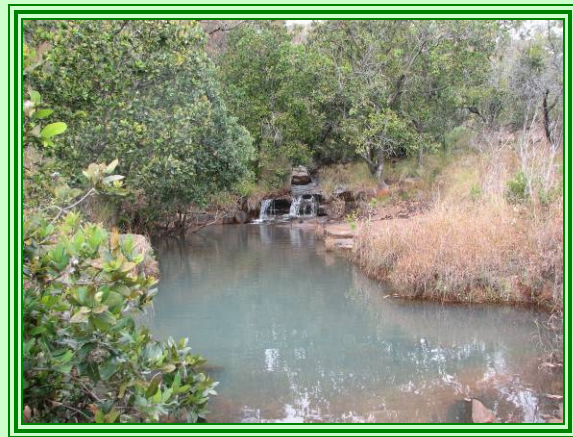
A41Matl-MATLA in the upper Marakele National Park