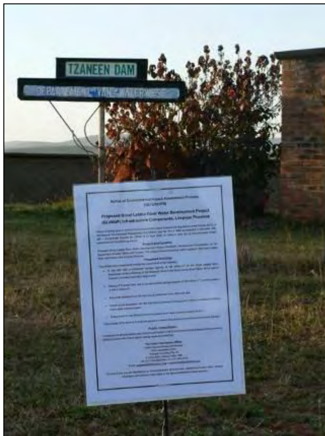
Plate 7.2: Notice at the Tzaneen Dam