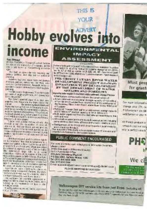
Plate 7.1: Example of advertisement