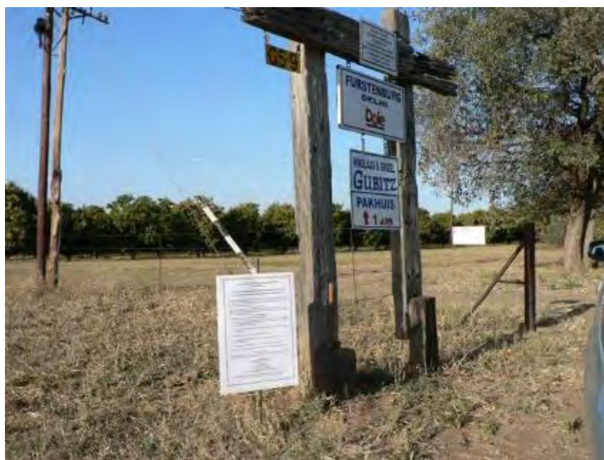
Plate 7.3: Notice board on the road reserve at the Gubitz Farm