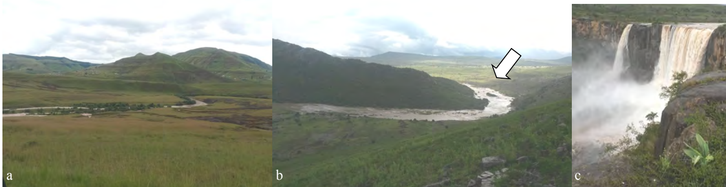
Umboniso 2– iifoto ezithathiweyo zeziza ezicetywayo ngoMatshi 2014 a) isiza esicetywayo seDama iNtabelanga; b) indawo yodonga ecetywayo yeDama iLaleni; kunye c) neeNgxangxasi zaseTsitsa.

Ngaphezu koko, uphononongo olwenziweyo luchonge iihektare eziyi-2 868 zomhlaba ongalulungela kakhulu ulimo olunkcencshelwayo ( Umboniso 1 ). Malunga nehektare eziyi-2 450 zomhlaba zikwindawo yakuTsolo zize ezinye zibe kufutshane nedama kwanangasemlanjeni. Umhlaba wolimo uza kunikezelwa kunye namanzi angacocwanga ampontshwa ukusuka kwiDama laseNtabelanga kuze kwezinye iindawo amanzi ampontshwe ngemibhobho ukusuka kwindawo yotsalo kumlambo okufutshane kuMlambo iTsitsa, emazantsi kwedama.