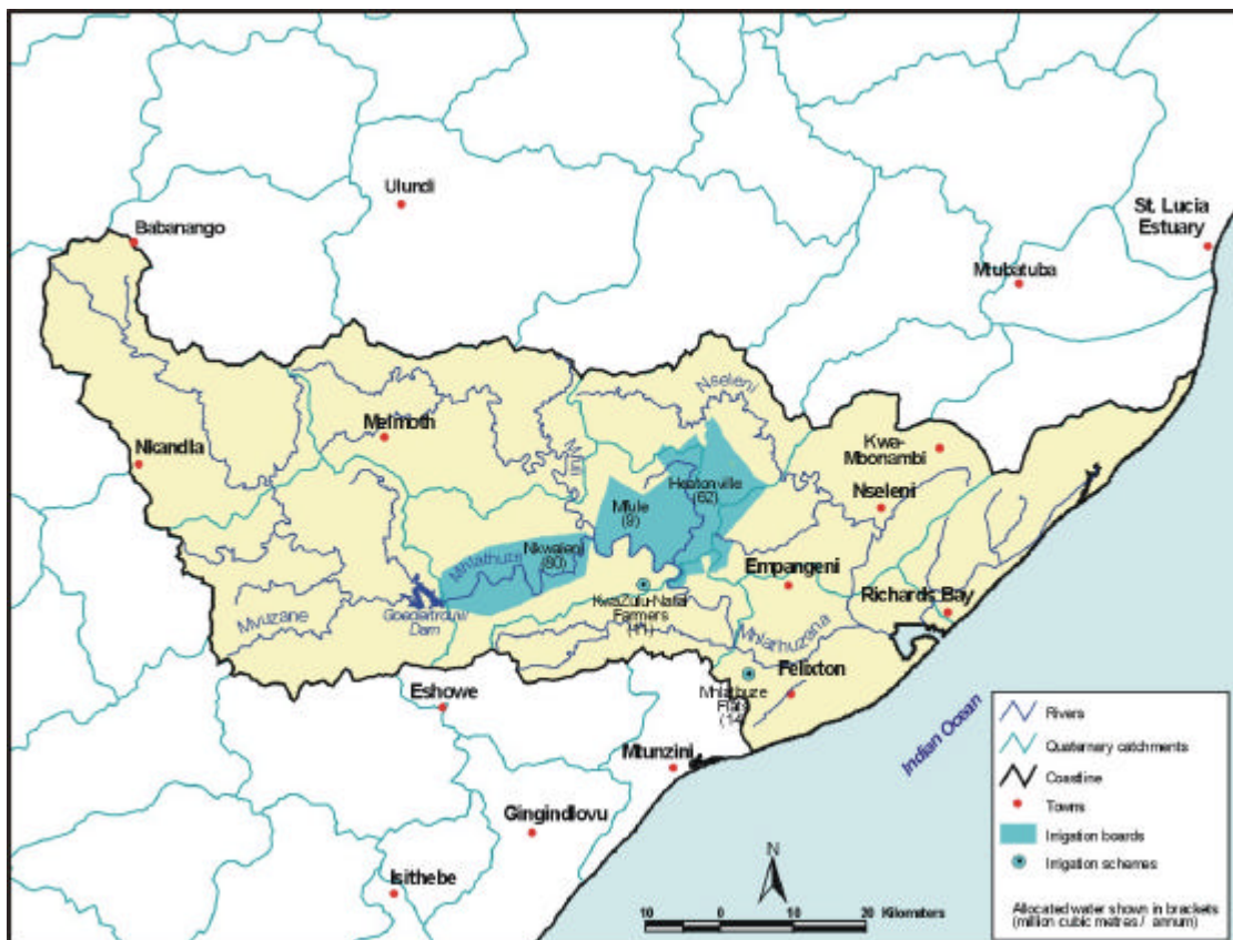
Figure 4.3: Irrigation Boards in the Mhlathuze catchment – allocated water in brackets, million m^3 /annum