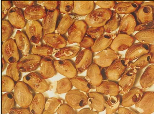
Feeding damage by Melanterius larvae (note holes in seeds)