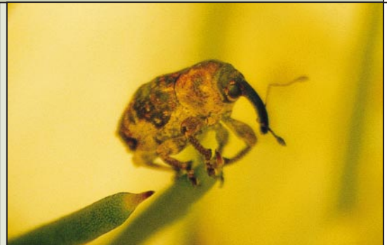
Erytenna weevil on leaf

The larvae destroy the green developing fruits of Hakea sericea . At some sites, the weevils have destroyed more than 80% of the seeds. Weevils can be found on the plants all year round but they are most active and easiest to collect between May and July.