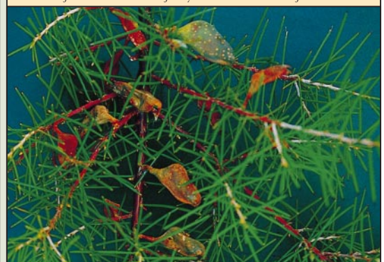
Hakea after introduction of Erytenna - with damaged fruit capsules