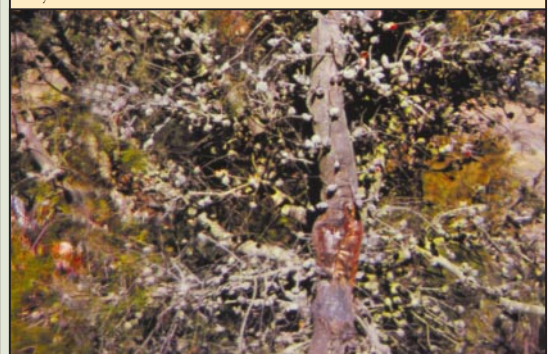
Hakea before introduction of Erytenna - covered in fruit