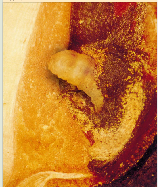
Larva of the hakea seed-moth inside a hakea fruit