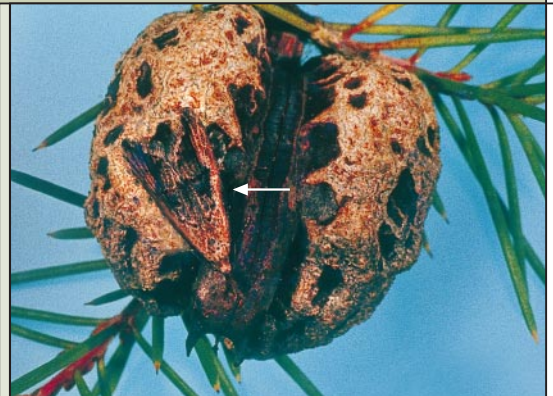
Adult hakea seed-moth on a hakea fruit

Because the larvae destroy the seeds in mature fruits of Hakea sericea they reduce the quantity of seeds available for regeneration after fires. Field observations indicate that the seed-moth can destroy up to 80% of the accumulated seeds at some sites.