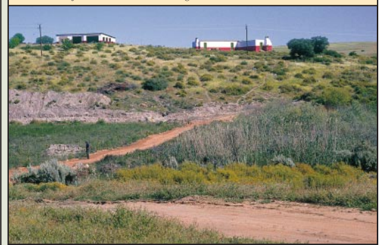
Sesbania infestation AFTER biological control