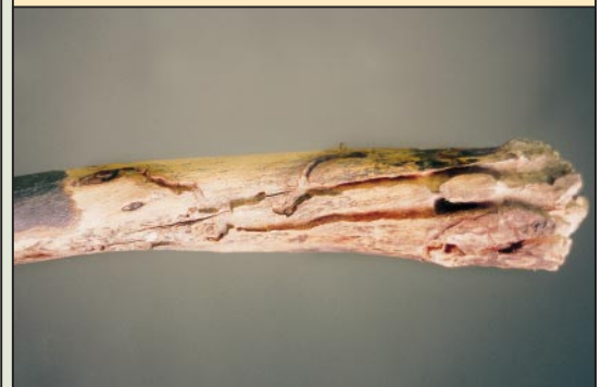
Sesbania stump with bark removed to show damage caused by sesbania stem borer